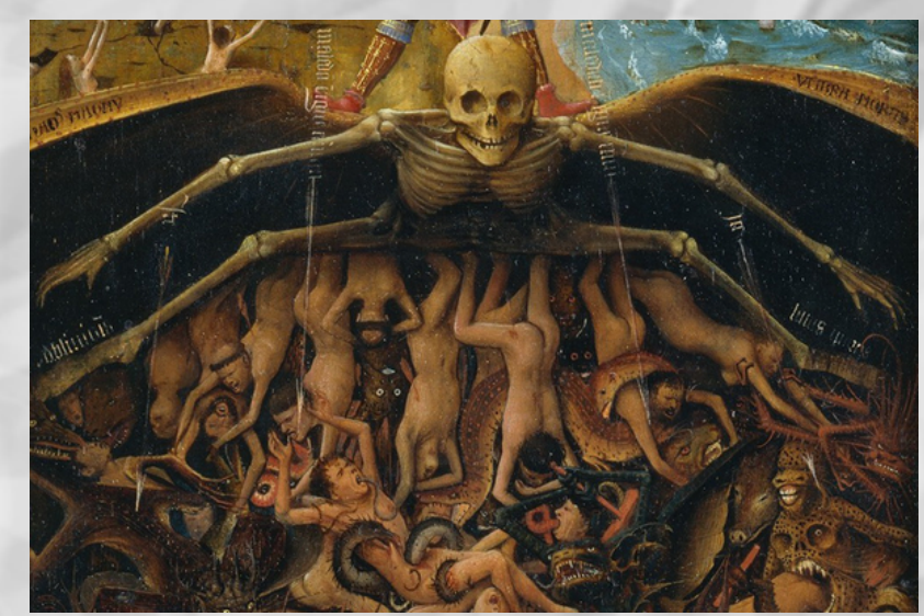
Death and the Afterlife

For more info speak to a member of the RE department.