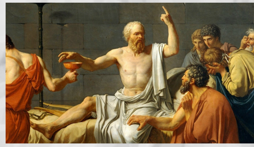
The Problem of Evil

Is the soul distinct from the body? Are we just a mind?